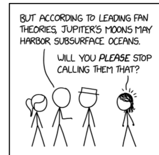
HOW TO ANNOY SCIENTISTS: REFER TO ALL HYPOTHESES AS "FAN THEORIES"

Do you have any questions about studying? Would you like to learn more about us or our events? Or do you even want to join the FSI? Then you can contact us either by mail (see below) or in person: We have weekly service hours, which are on Tuesdays 12-13 in the Math FSI room under H11 and on Wednesdays 14-15 in the Physics FSI room under HF or you just can knock on the door if someone's there. Our meetings are from Oct the 12th on every Wednesday at 6 pm – in even calendar weeks in the physics FSI room, in odd weeks at the mathematics FSI room. We are looking forward to seeing you!